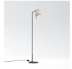
CODE: 1394012 FINISH: BRONZE

TO MAINTAIN THIS PRODUCT TO ITS BEST CONDITION, PLEASE VIEW OUR CARE AND CLEANING GUIDE ON THE SUPPORT SECTION OF THE ASTRO WEBSITE.