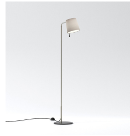
CODE: 1394011 FINISH: MATT NICKEL